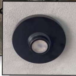
Personal Directional Lights