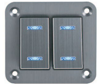
Cockpit Light Switches