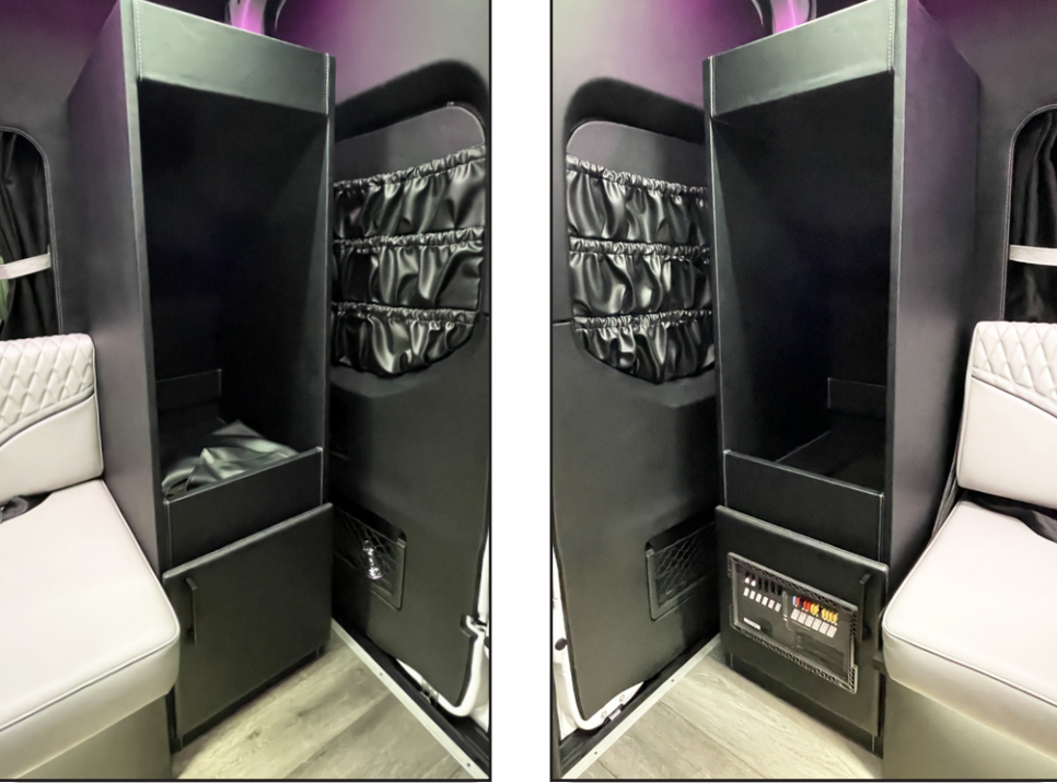
Custom Storage Cabinets and Pouches