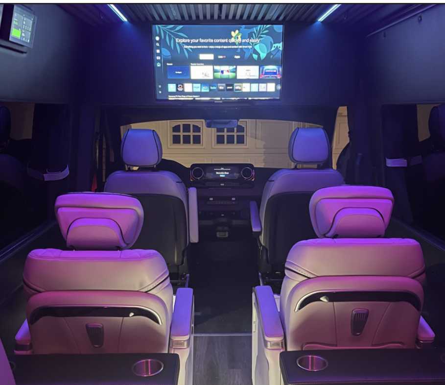
Rear Facing TV - Low Light