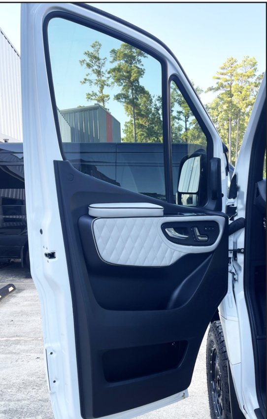
Custom Door Panels