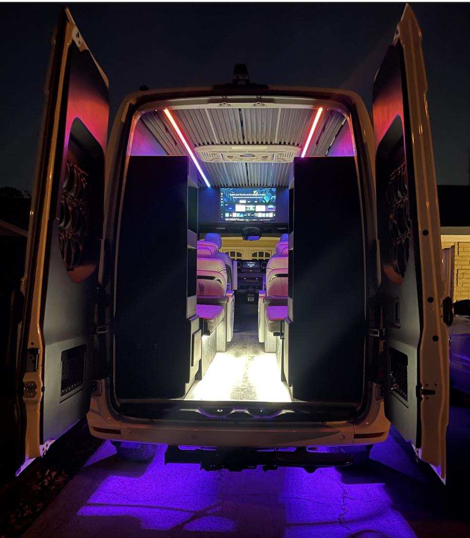
Cabin View from Back