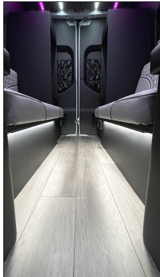
Floor LED Lighting