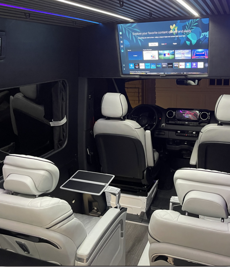
Rear Facing TV - Bright Light