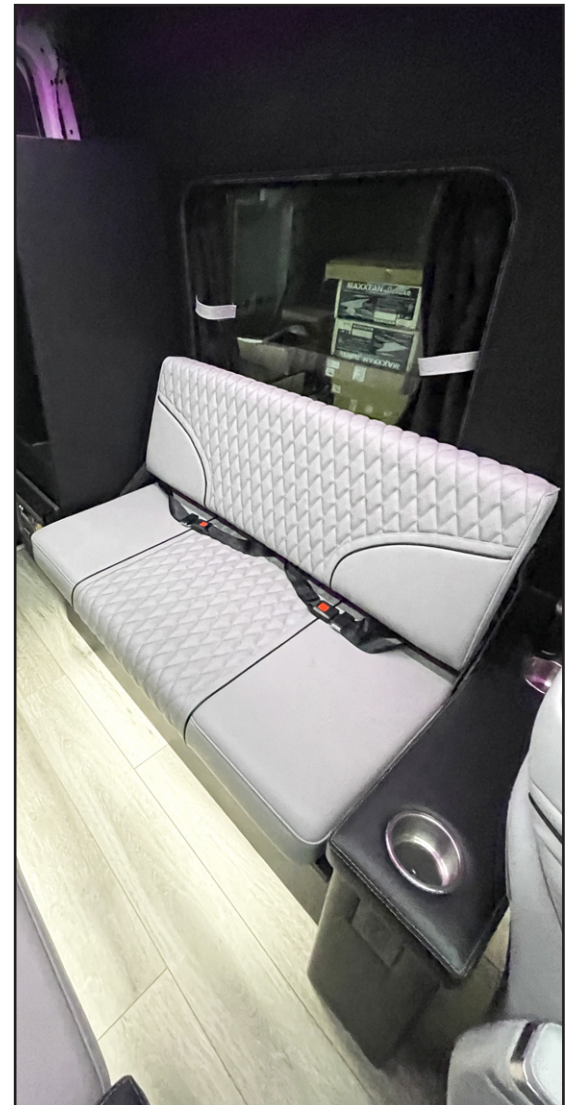
Four Person Bench to Bed